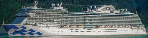
Discovery Princess at sea

28 Oct 2025 Maiden Voyage in Singapore One & Only Sail Date Not to be Missed!